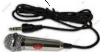
Wired Handheld Microphone