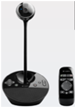
Webcam + Remote