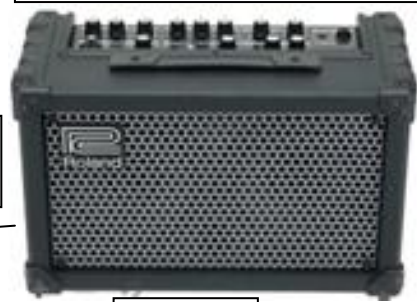
Audio IN #2