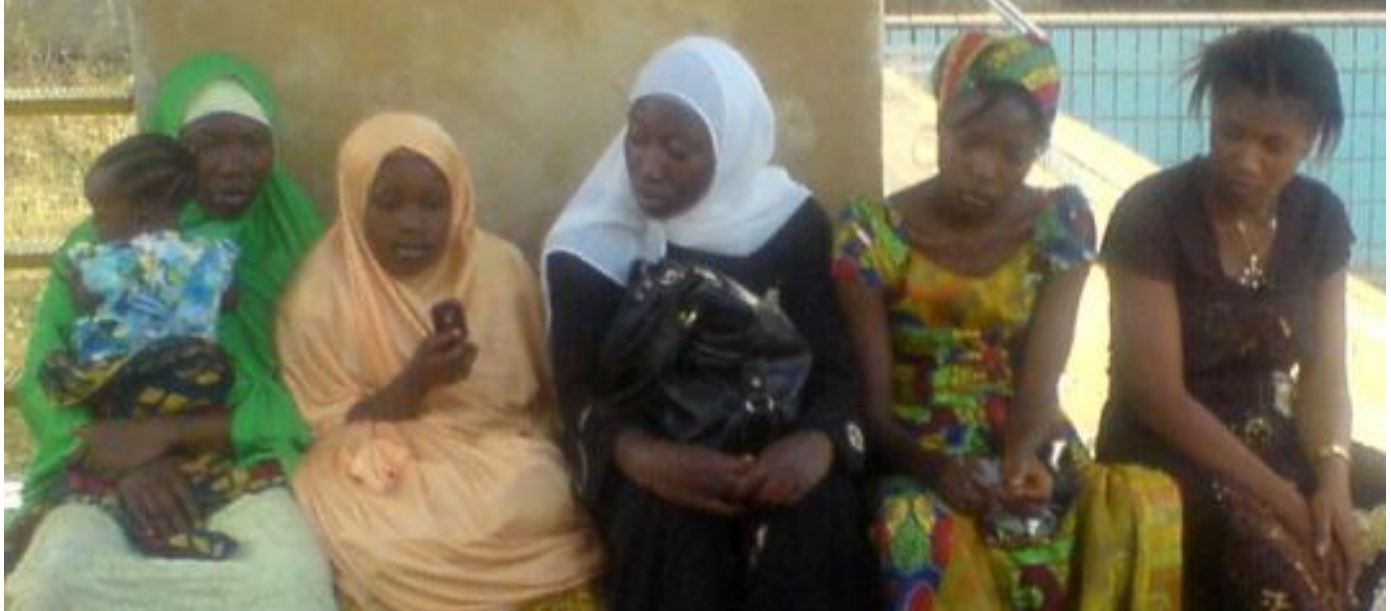
See the larger story of resulting social outcomes during the following years at <a href="http://traubman.igc.org/vidnigerianorth.htm">http://traubman.igc.org/vidnigerianorth.htm</a>