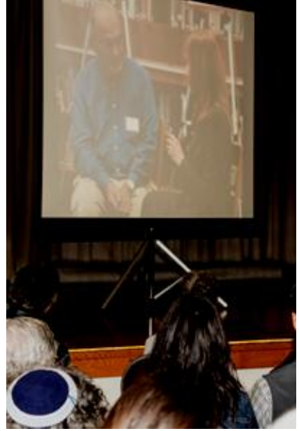
Story Sharing Experience — In dyads, with a new acquaintance A stranger or "an enemy is one whose story we have not heard."