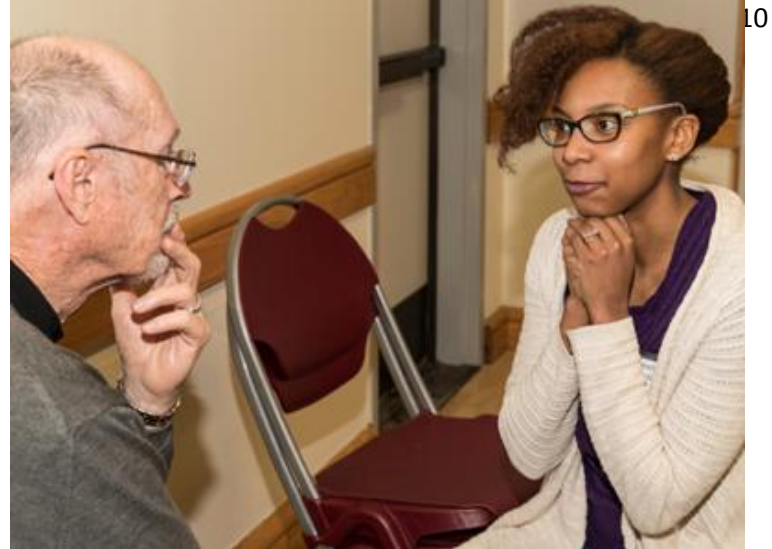
Assimilation of Story-sharing Experiences — By partners