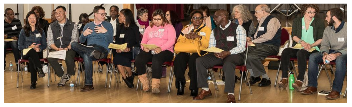
Self-Introductions Around the Circle — Who is in the room?