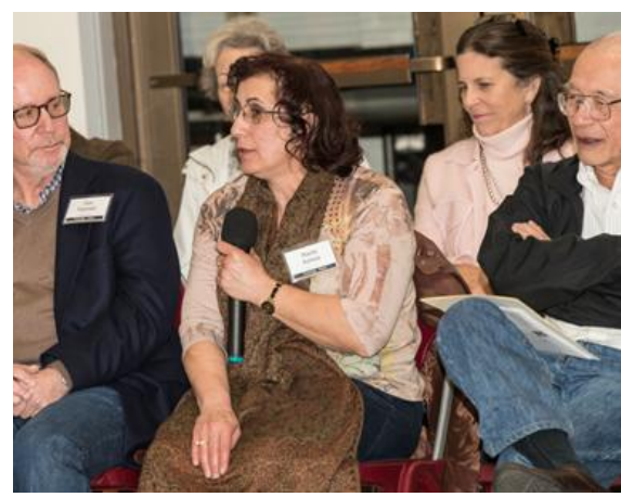
18-minute Film — Two exemplars of story sharing and quality listening