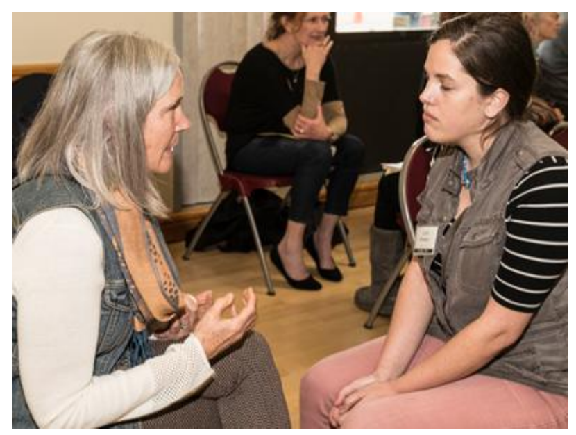
"People fail to get along because they fear each other.

They fear each other because they don't know each other;