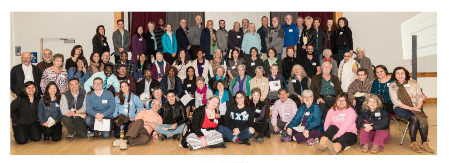
(on the Web)