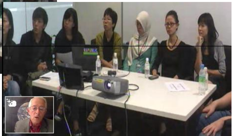
Beginning With Brief Personal Introductions