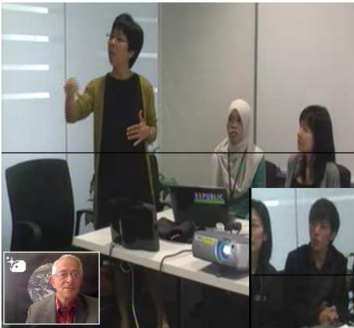
Establishing Internet Connection