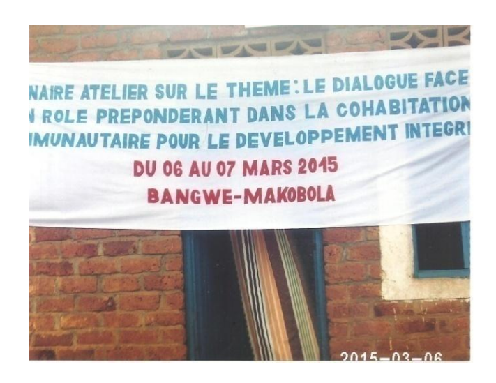
ACTIVITY Saturday, March 7, 2015.

Interview with the working committee in office of the Association "ARMMK" for the preparation of the day of March 7, 2015.