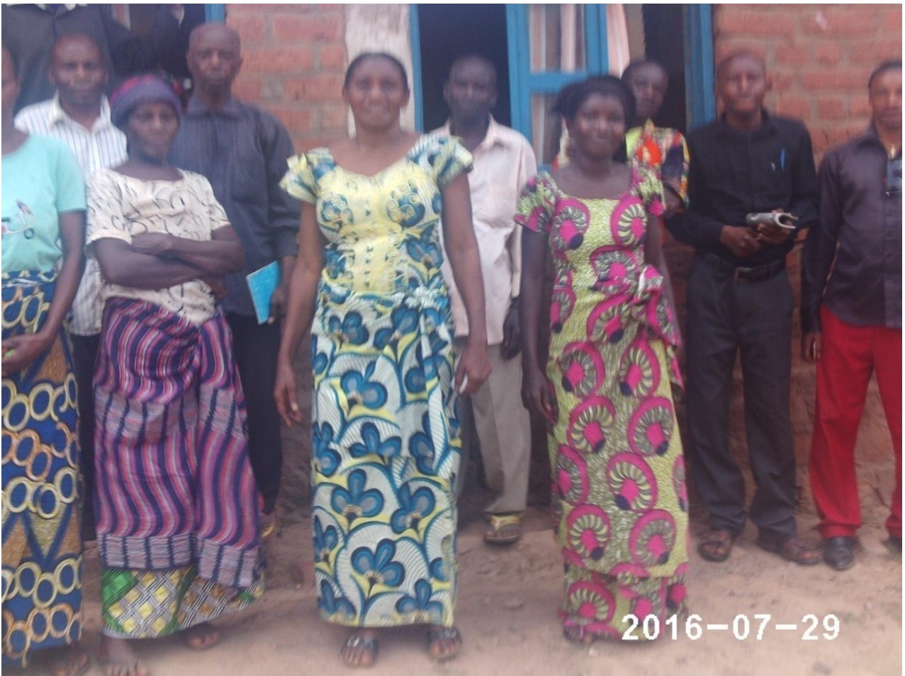
These two photos were taken by two different cameras pictures.