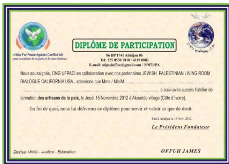
Certificates given to the villages chiefs (left) and all participants (right).