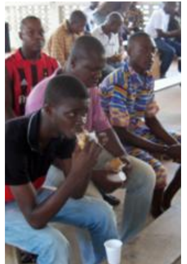
At break time, elders then other participants move toward the stewards for their share of fast food and juices.