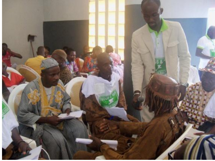
Each one explains what was awakened and had meaning for them during and after the face-to-face personal story telling and being truly listened-to and heard for the first time.