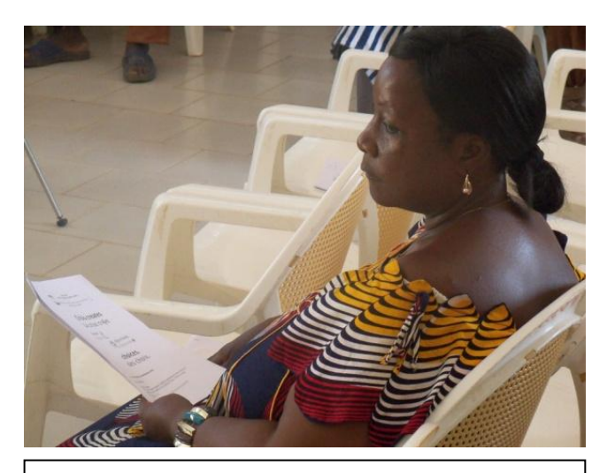
Participant with her printed how-to materials.