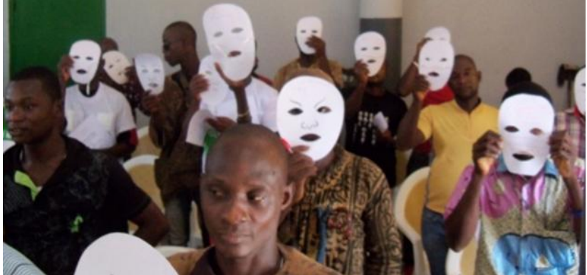
The Mask & Culture exercise helped people reveal what was hidden inside, how culture inhibited them from being their true, best selves. Dozos and Wee-Guerre men and women began mixing together more comfortably.