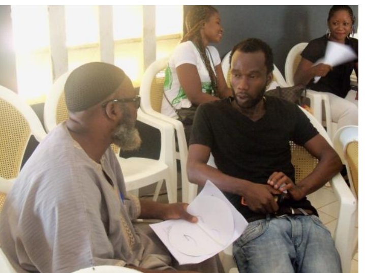
Malinke man and Guerre youth listen together.