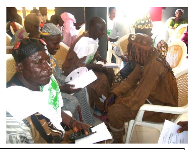
Dozos participant face-to-face with a Guerre chief for the first time hearing each others' personal narratives.