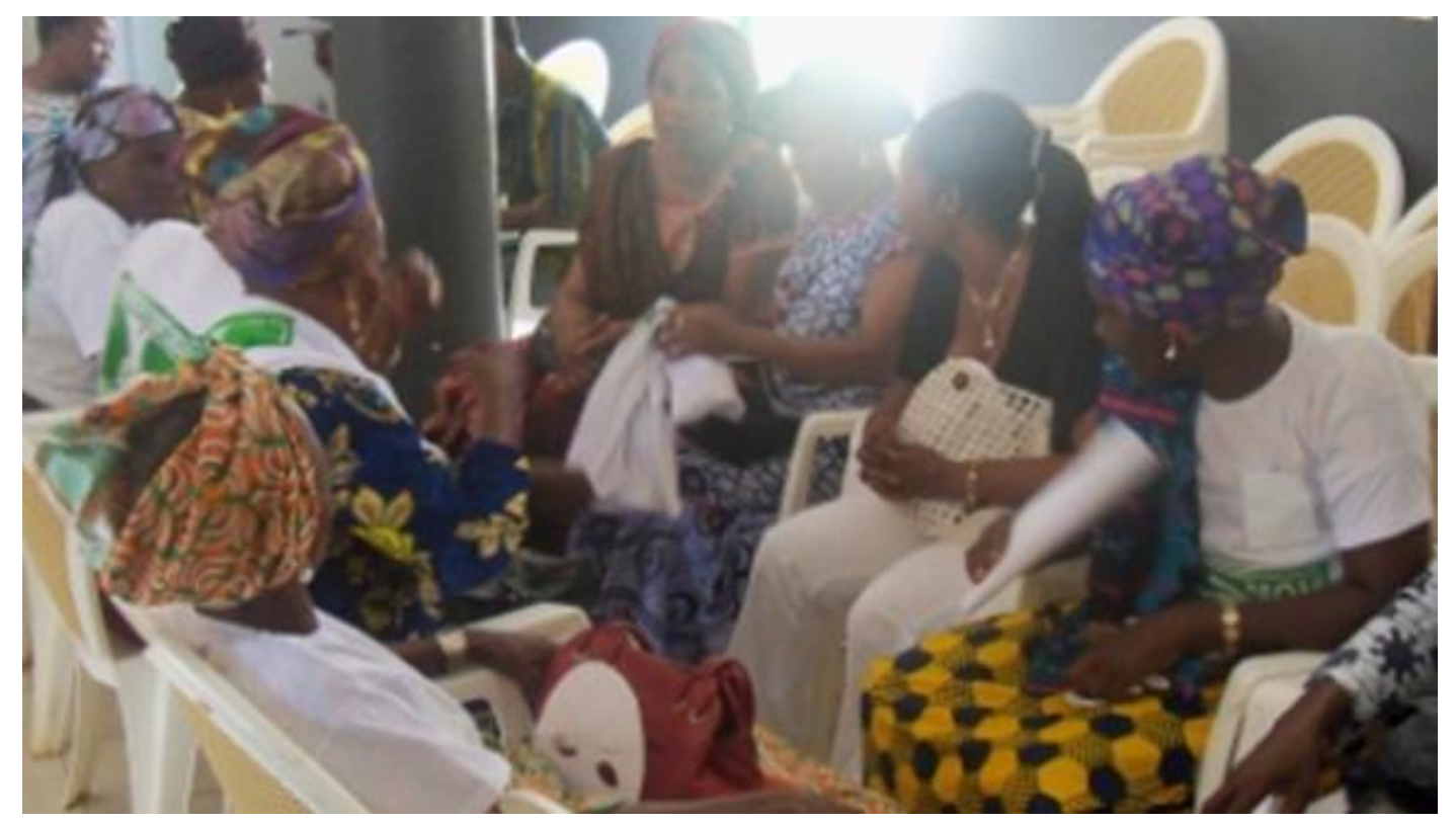
Diverse women begin communicating at the heart across old barriers to hear each other's life stories.