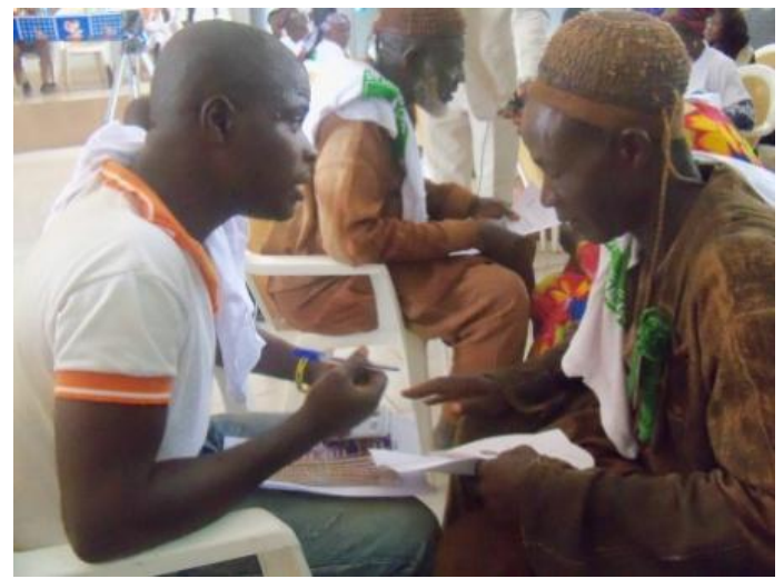
Dozos and Guerre youth and adults knees-to-knees, face-to-face for the first time.