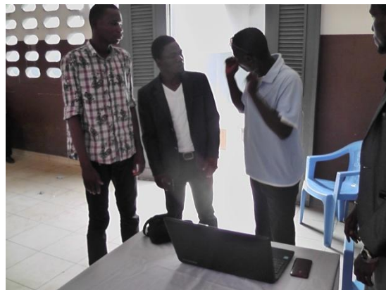
Drama on proving the talents of a non hearing person as a computer technician