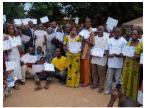
Conference participants with travelling facilitators from the NGO United for Peace Against Conflict International (ONG UFPACI).